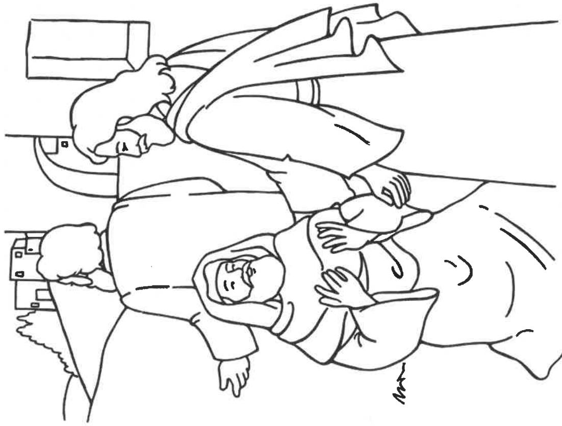
The Ten Lepers Luke 17:11-19