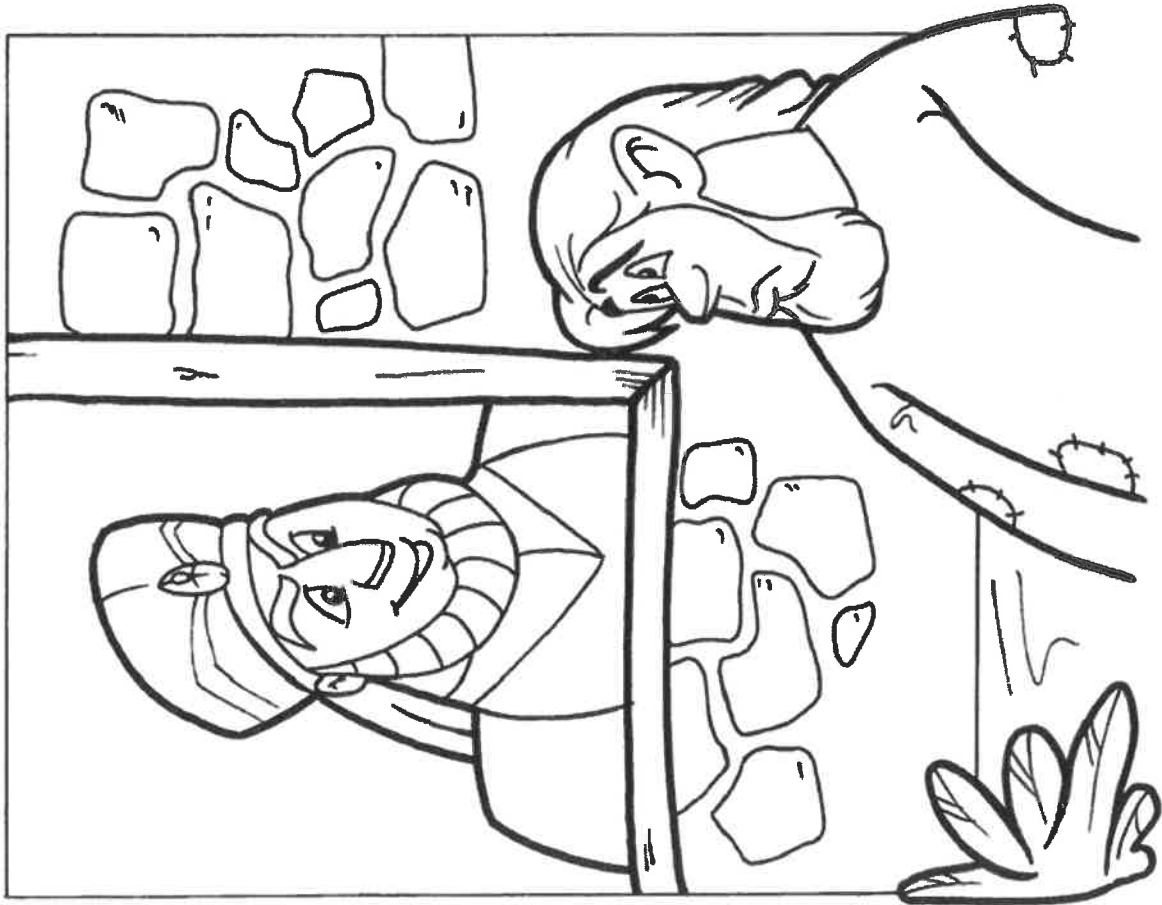
The Rich Man and Lazarus