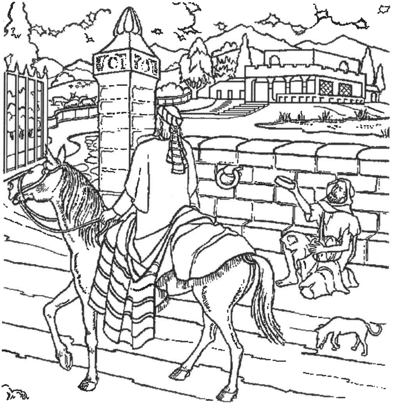
The Rich Man and Lazarus Luke 16:19-31