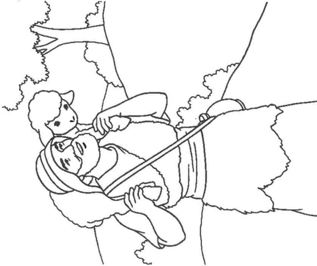
The Parable of the Lost Sheep