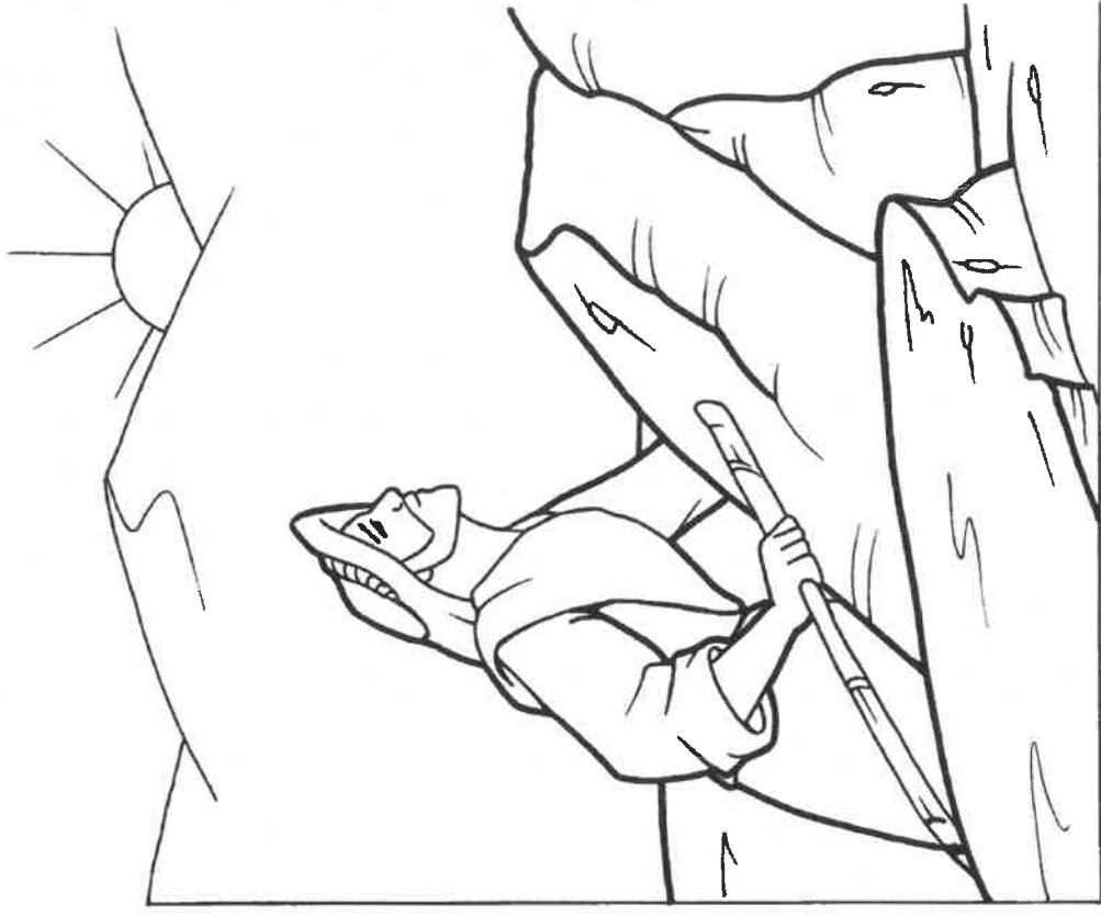
The Temptation of Jesus