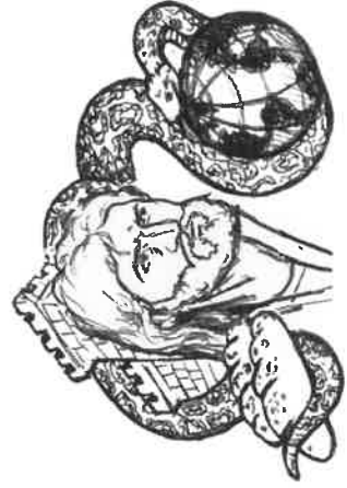
The Temptation of Jesus