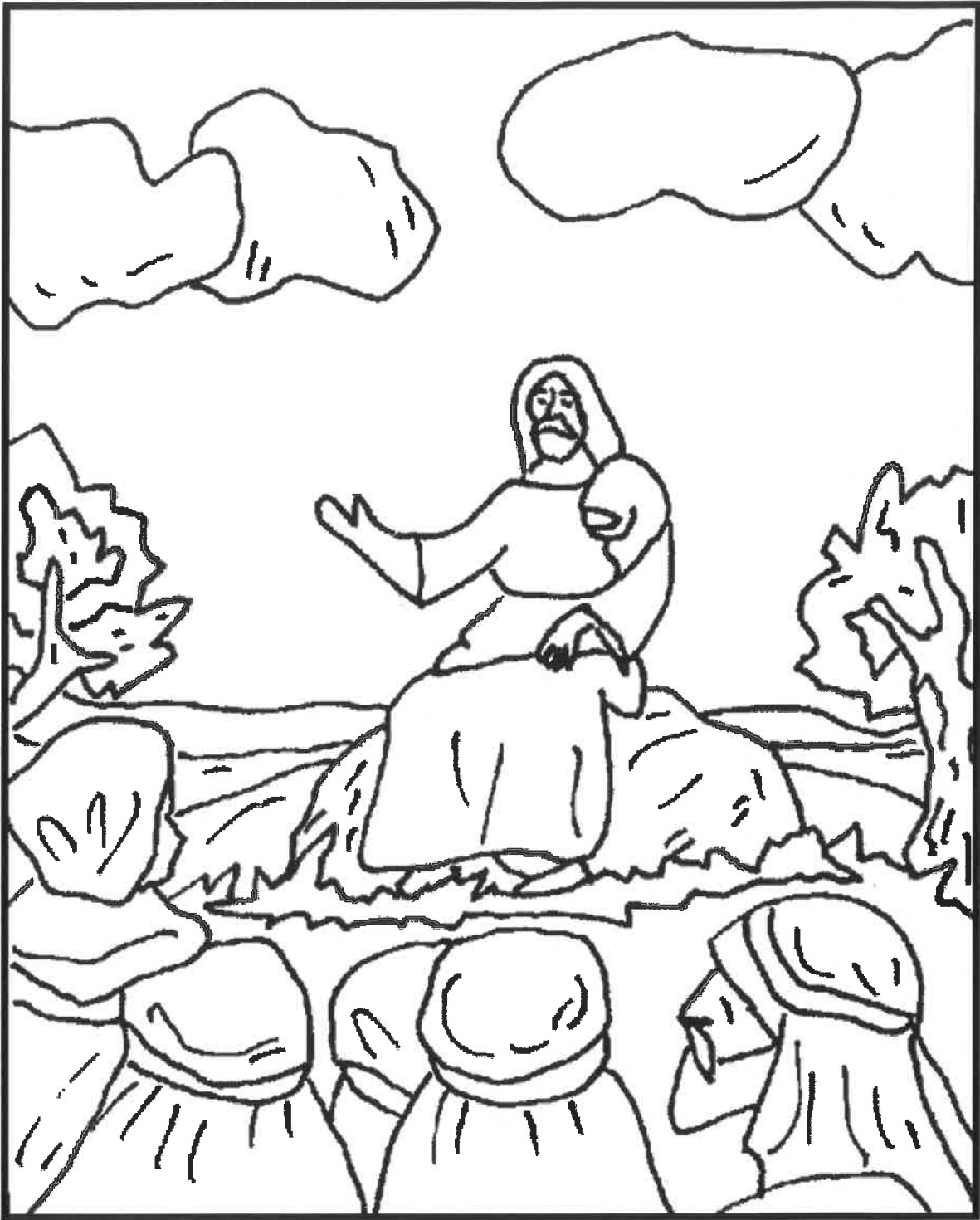
The Sermon on the Plain