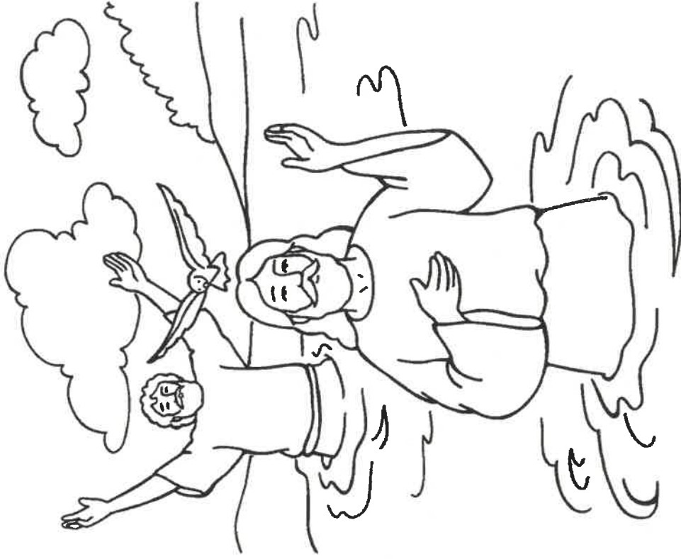
John Baptizes Jesus Matthew 3, Mark 1, Luke 3

From Thru-the-Bible Coloring Pages for Ages 4-8. © Standard Publishing. Used by permission. Reproducible Coloring Books may be purchased from Standard Publishing, www.standardpub.com, 1-800-543-1301.