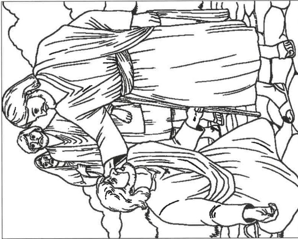
Jesus Heals a Blind Man Mark 10:46-51

From BibleStoryCard Learning System™ Coloring Book © 1996 Wesleyan Publishing House http://www.parable.com/wp/h/group_1052.htm