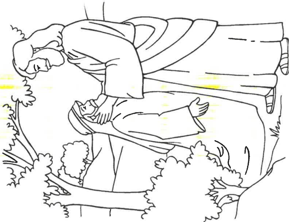
Jesus Heals a Deaf Man Mark 7:31-37