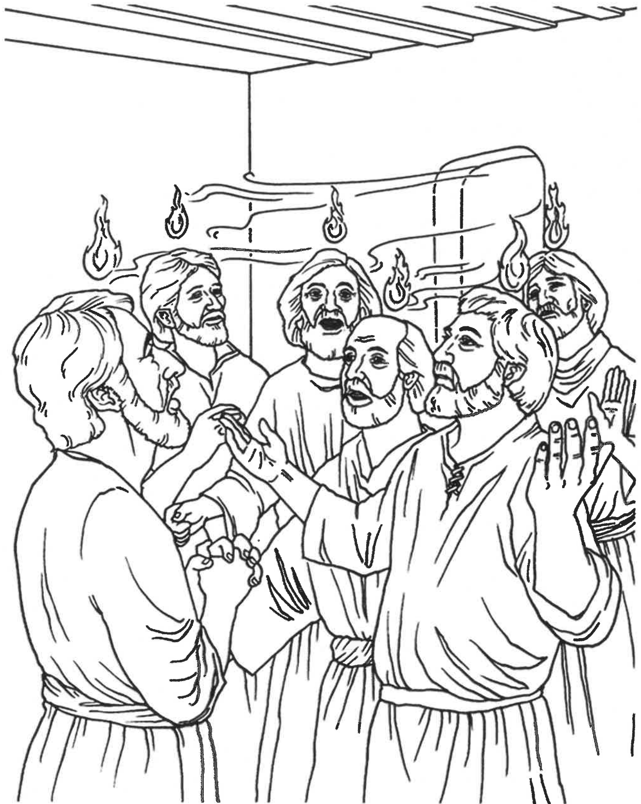
The Day of Pentecost Acts 2