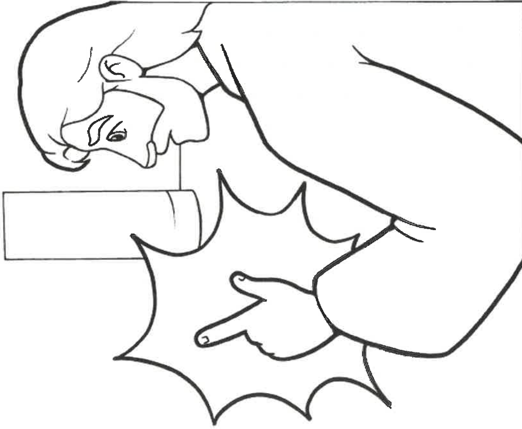
Jesus Appears to the Disciples