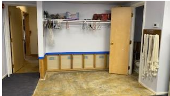
Bathroom Pipes Busted in the Children's Church/Vesting Room