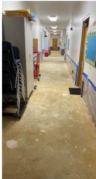
Preschool Hallway After Thursday, March 18, 2021