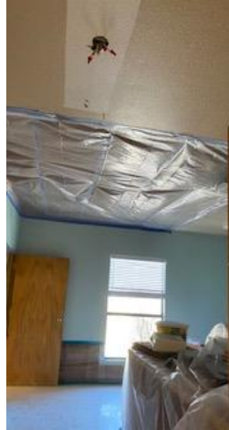
Preschool Classroom C Thursday, March 18, 2021