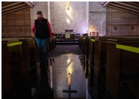
From the NYTimes-Feb 20, 2021