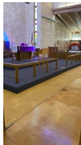
Nave & Altar Worship Area