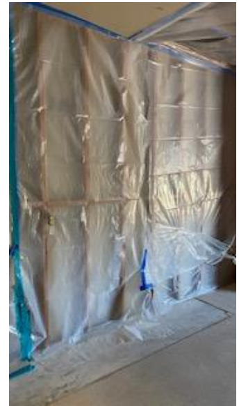
Preschool Room C