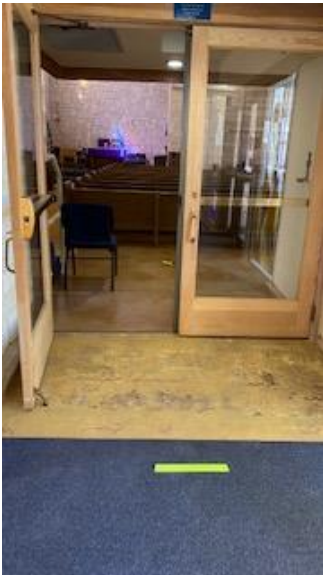
Entrance to Worship Area