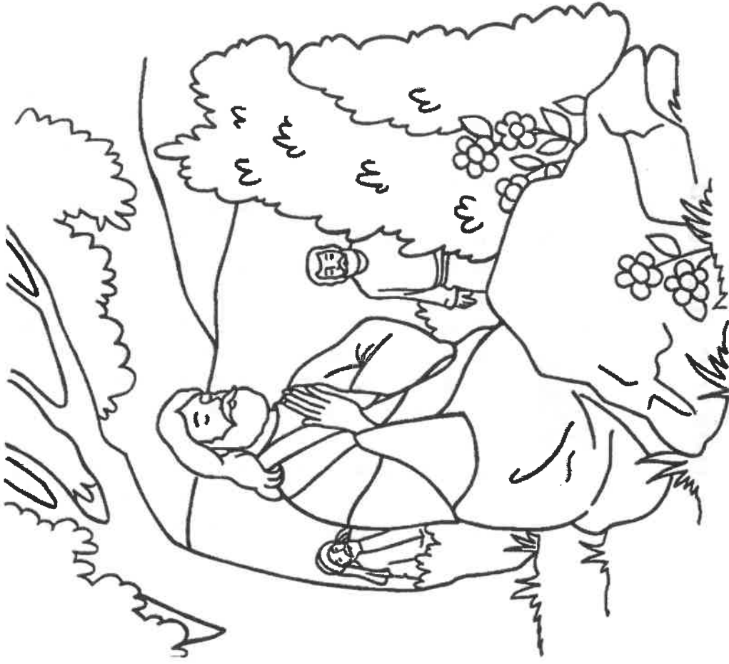
Jesus Prays in a Solitary Place

From Thru-the-Bible Coloring Pages © 1986, 1988 Standard Publishing. Used by permission. Reproducible Coloring Books may be purchased from Standard Publishing, www.standardpub.com, 1-800-543-1301.