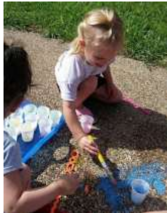
Preschool Fun Day!